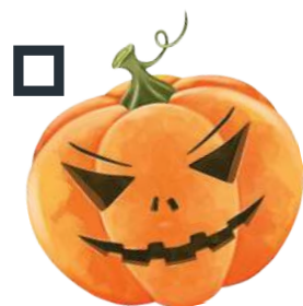
JACK O' LANTERN